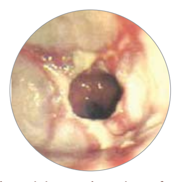
These endoscopic images show views of the esophagus with findings of severe gastroesophageal reflux disease, a common cause of esophageal narrowing that may be treated with dilation.