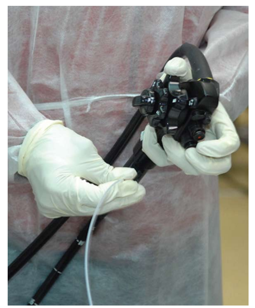
An endoscope is a medical device used by expert physicians to look inside the digestive tract.

After the dilation is done, you will probably be observed for a short period of time and then allowed to return to vour normal activities. You may resume drinking when the anesthetic no longer causes numbness to your throat, unless your doctor instructs you otherwise. Most patients experience no symptoms after this procedure and can resume eating the next day, but you might experience a mild sore throat for the remainder of the day. Your doctor will advise you on eating and drinking. If you received sedatives, you probably will be monitored in a recovery area until you are ready to leave. You will not be allowed to drive after the procedure even though you might not feel tired.